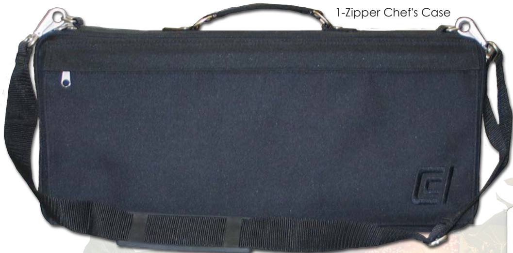
1-Zipper Chef's Case