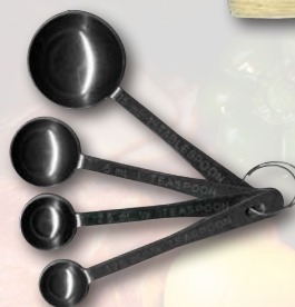
4 Piece Measuring Spoons