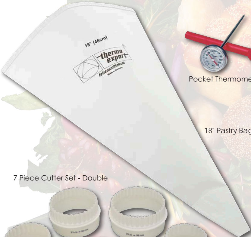
18" Pastry Bag