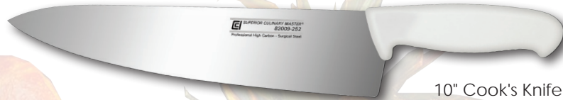
10" Cook's Knife