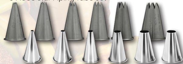
6 Piece Hole Piping Tube Set