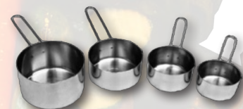
4 Piece Measuring Cup Set

The above tools have been selected by your Baking Instructors.