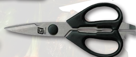
Take-A-Part Kitchen Shear