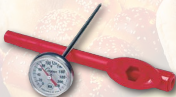
Pocket Thermometer, 220°F