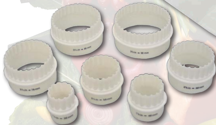
7 Piece Cutter Set - Double